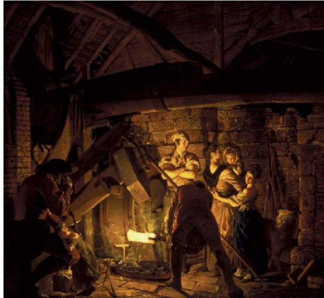
Chiaroscuro painting by Joseph Wright of Derby An Iron Forge (1772)